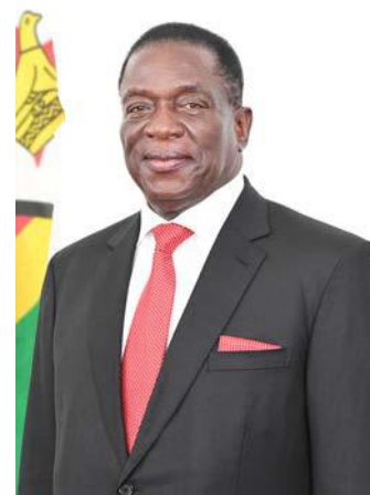
His Excellency, President of the Republic of Zimbabwe E. D. Mnangagwa

Devolution was adopted as a key component of the new 2013 Constitution of Zimbabwe which, in Chapter 14, states that it is desirable to ensure the preservation of national unity in Zimbabwe, prevention of all forms of disunity and secessionism, the democratic participation in Government by all citizens and communities in Zimbabwe, and that “there must be devolution of power and responsibilities to lower tiers of Government in Zimbabwe” .